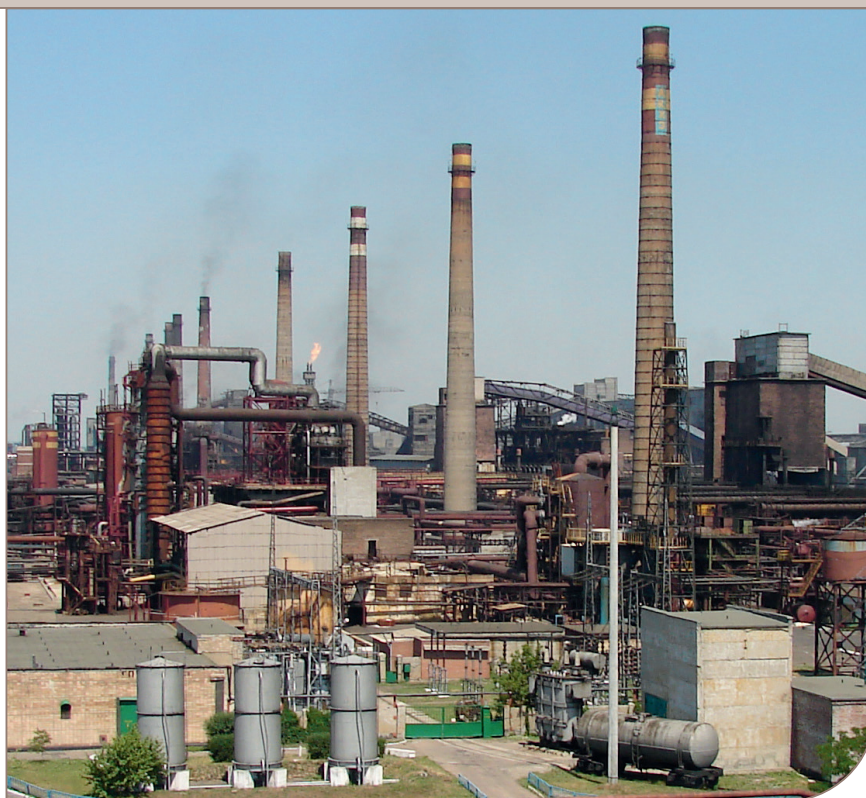
Avdeevskiy coke processing works in Ukraine was the first plant of its type to invest in closed final gas cooling systems.

These systems comprised a three-stage spiral heat exchanger (SHE) tower, which would allow the gas to be scrubbed and cooled before the benzene scrubbers. In this arrangement, the COG enters the upper part of the SHE tower, passes through stages I, II and III, and is released through an outlet at the bottom of the vessel. It then continues to the benzene scrubbers.