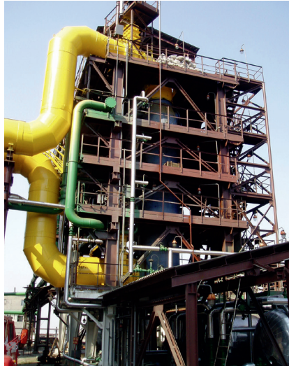
Final coke oven gas cooler. An Alfa Laval spiral column installed at Avdeevskiy coke processing works.

Semen Kaufman relates that the performance of the benzene section was improved by means of a decrease in COG temperature after the final gas cooler.