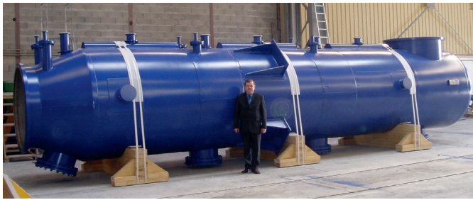
Spiral heat exchanger column supplied by Alfa Laval. The unit is 11.5 metres high and 2.1 metres in diameter.