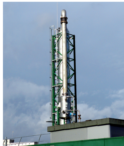
One of two spiral condenser distillation columns at the Remat Chemie plant.

On the horizon, Remat Chemie and Alfa Laval are looking at other ways to optimize plant operation. One proposal under consideration is using Alfa Laval Compablocs as fractionator reboilers to increase throughput even further.